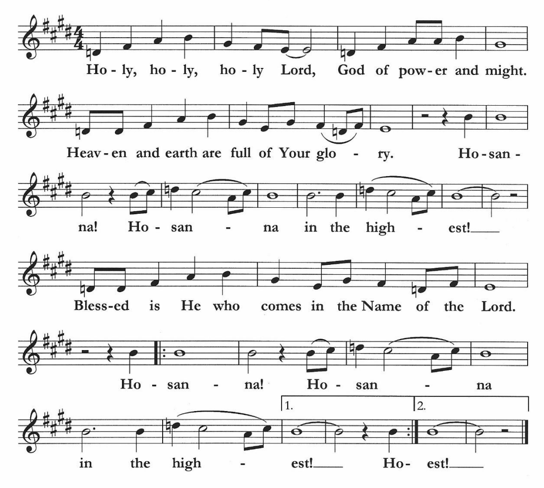
music by Peter Scholtes; ©1966 F.E.L. Publications; CCLI 3001024